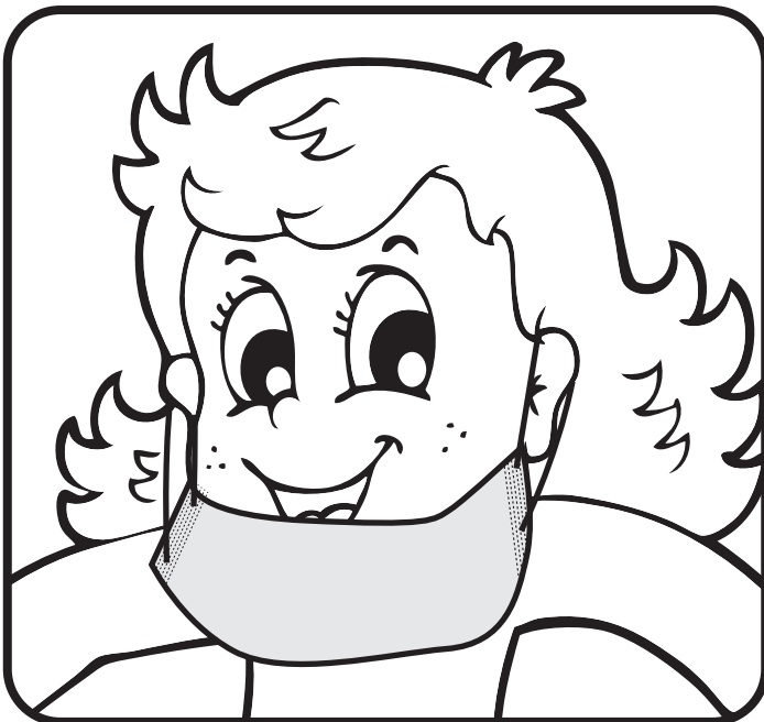
C. Under your chin