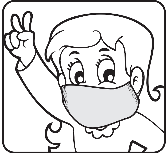
B. Covering your nose and mouth