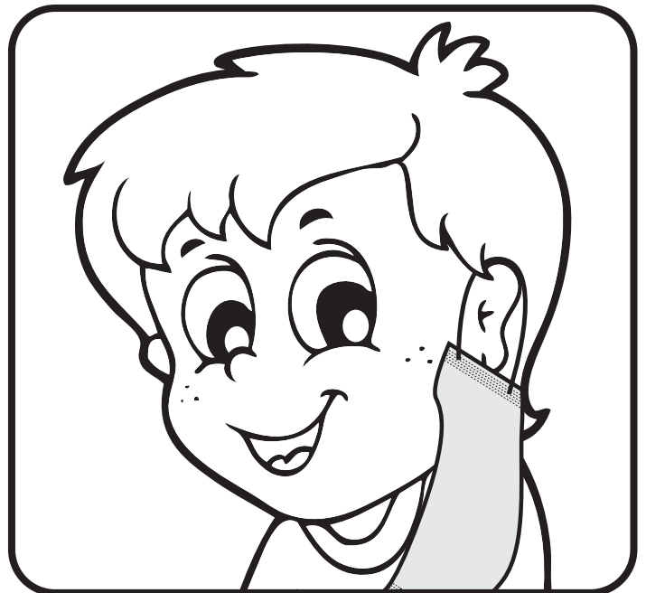
D. Hanging from your ear

Correct answer: B – Covering your nose and mouth