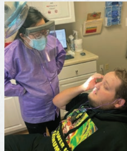
Mease Countryside Hospital and the other BayCare hospitals work with partners such as the Community Dental Clinic to serve low-income, uninsured adults with their urgent dental needs.

By December 31, 2025, expand access to health and social services through identification, screening and referral of underserved community members to address social determinants of health and their impact on health outcomes.