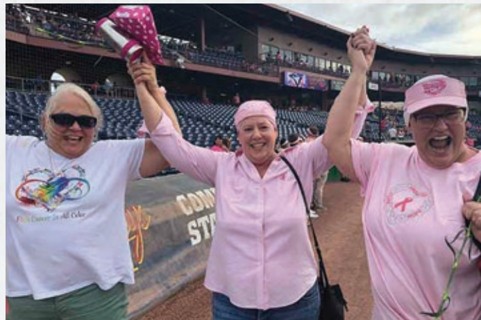
It was an emotional scene on National Cancer Survivors Day at BayCare Ballpark in Clearwater. Hugs were tight, tears flowed and joy filled the air. Physicians and members of the Morton Plant Mease breast cancer teams lined up to celebrate the women they knew so well at the annual Pitch for Pink event.

The 2023–2025 implementation plans for BayCare's Pinellas County hospitals were thoughtfully developed to leverage hospital and community resources, while also working collaboratively across multiple sectors to engage new community partners. To align with population and public health best practices and acknowledge that improving health is more than just accessing health care, the plans include a strong and directed focus on the social determinants that impact health.