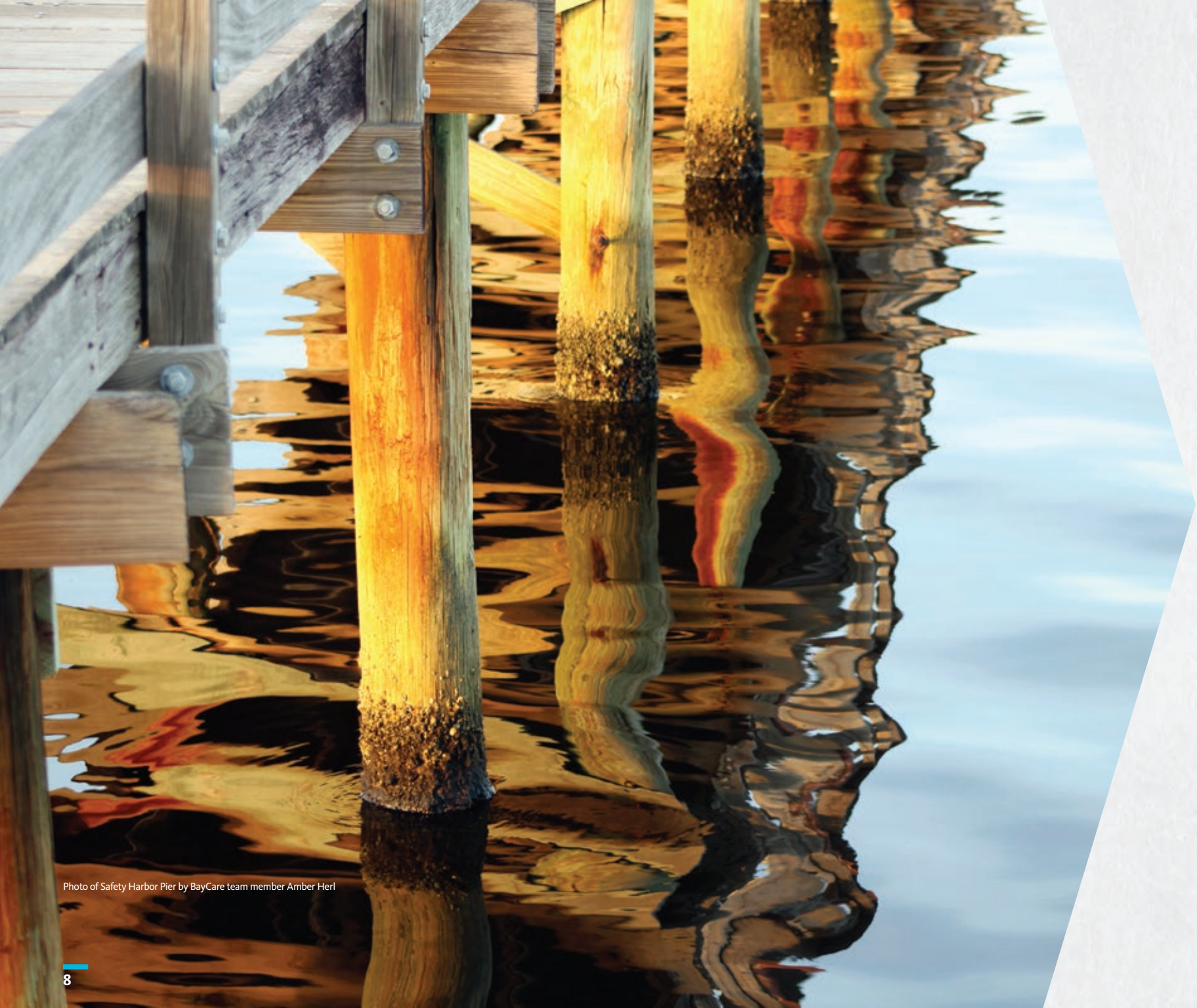
Photo of Safety Harbor Pier