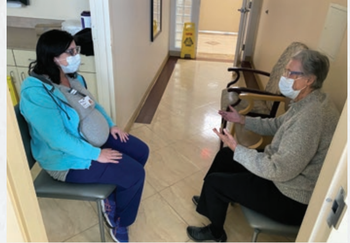
One of BayCare's behavioral health liaisons talks with a patient at Mease Dunedin Hospital. Liaisons work to provide therapeutic services, behavioral health referrals and resource connections.

By December 31, 2025, use an equity lens to implement a multifaceted, cross-sector behavioral health campaign to reduce stigma while increasing access to resources.