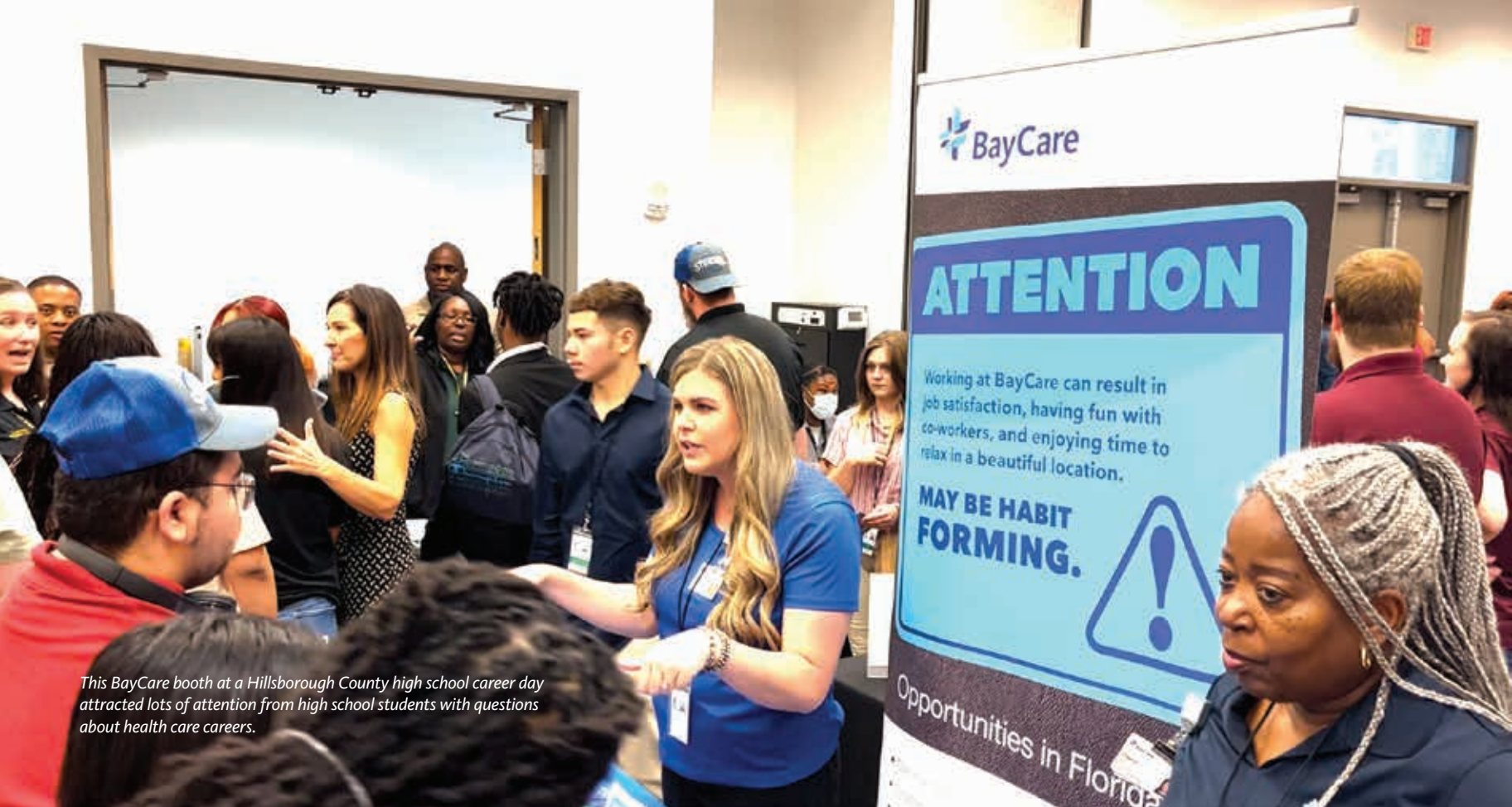
This BayCare booth at a Hillsborough County high school career day attracted lots of attention from high school students with questions about health care careers.