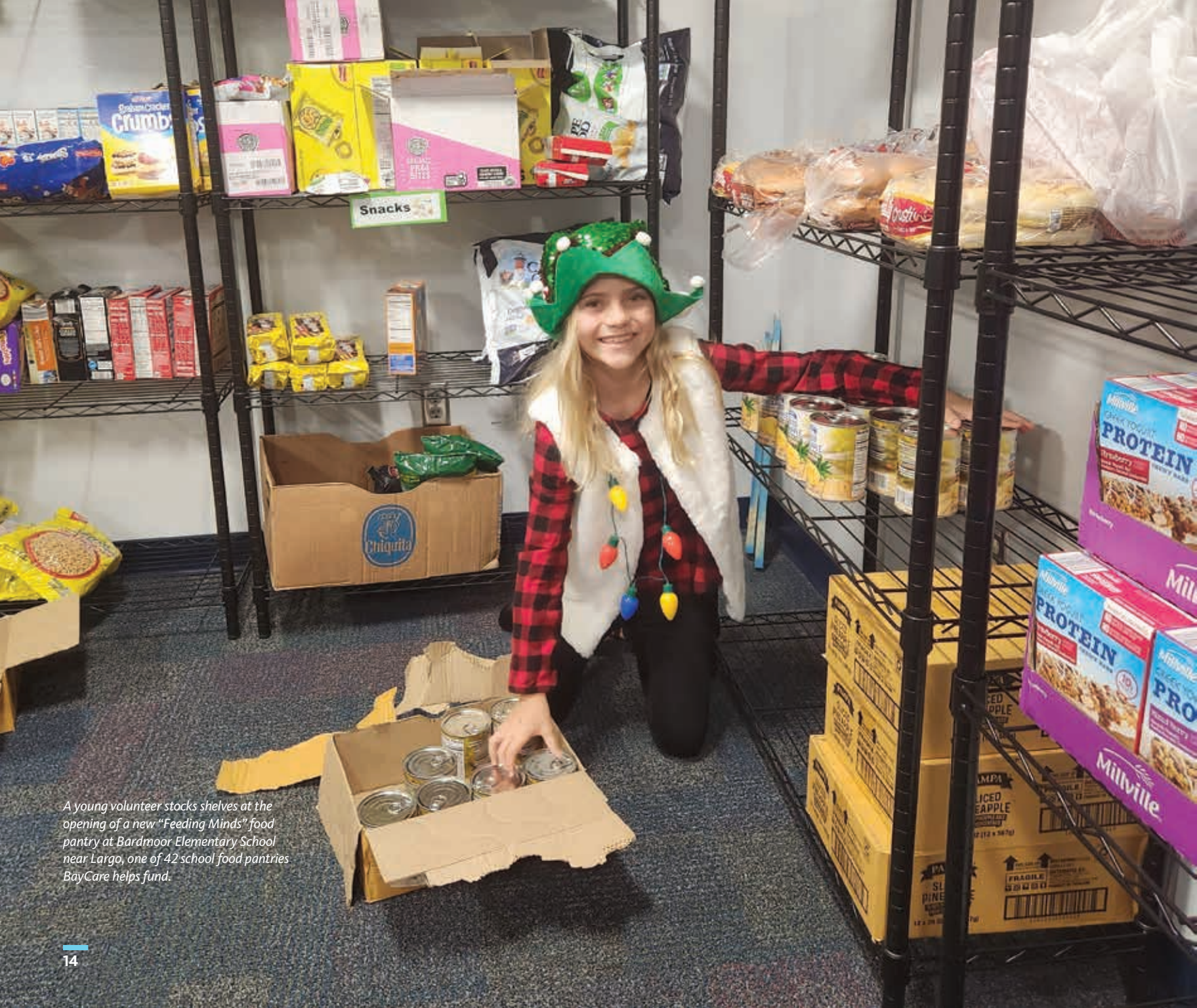
A young volunteer stocks shelves at the opening of a new "Feeding Minds" food pantry at Bardmoor Elementary School near Largo, one of 42 school food pantries BayCare helps fund.