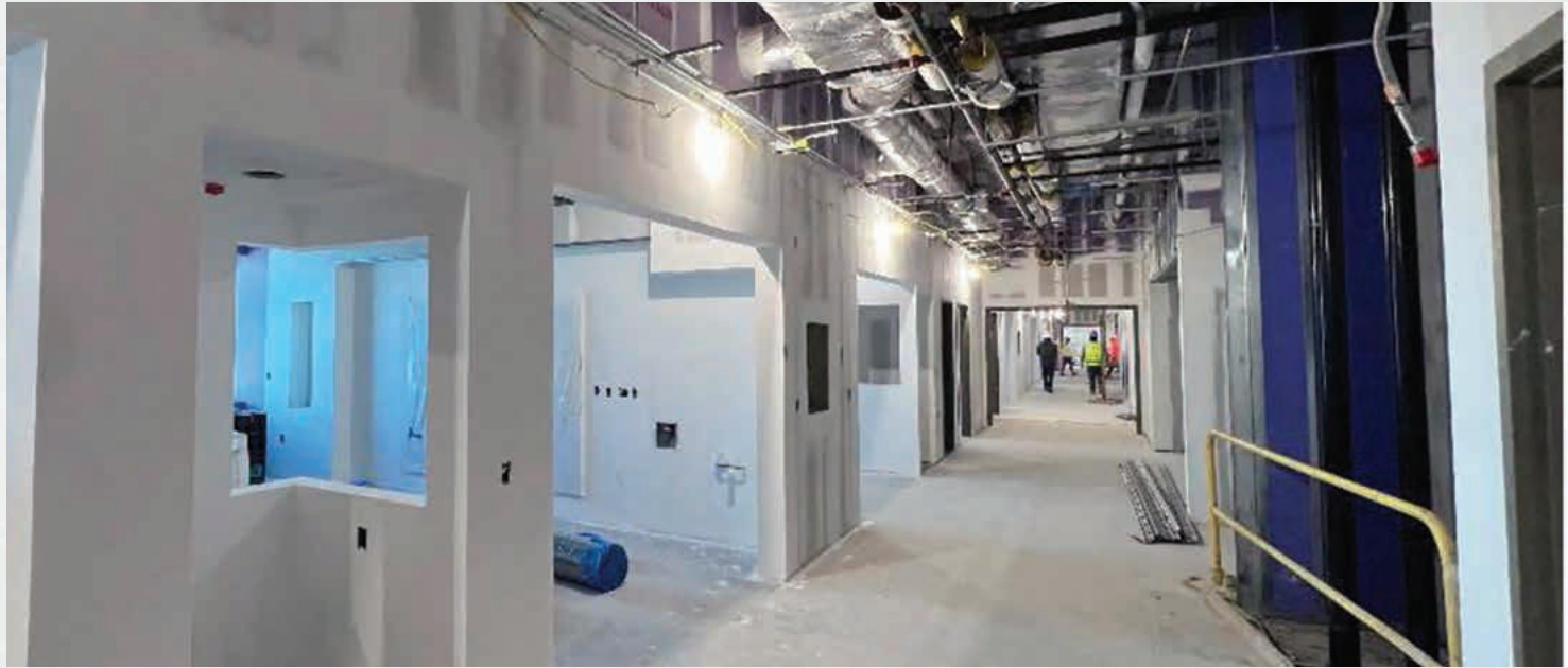
When South Florida Baptist Hospital in Plant City couldn't expand in its current location, BayCare chose to build a replacement hospital nearby. Interiors were well underway by the end of 2022.