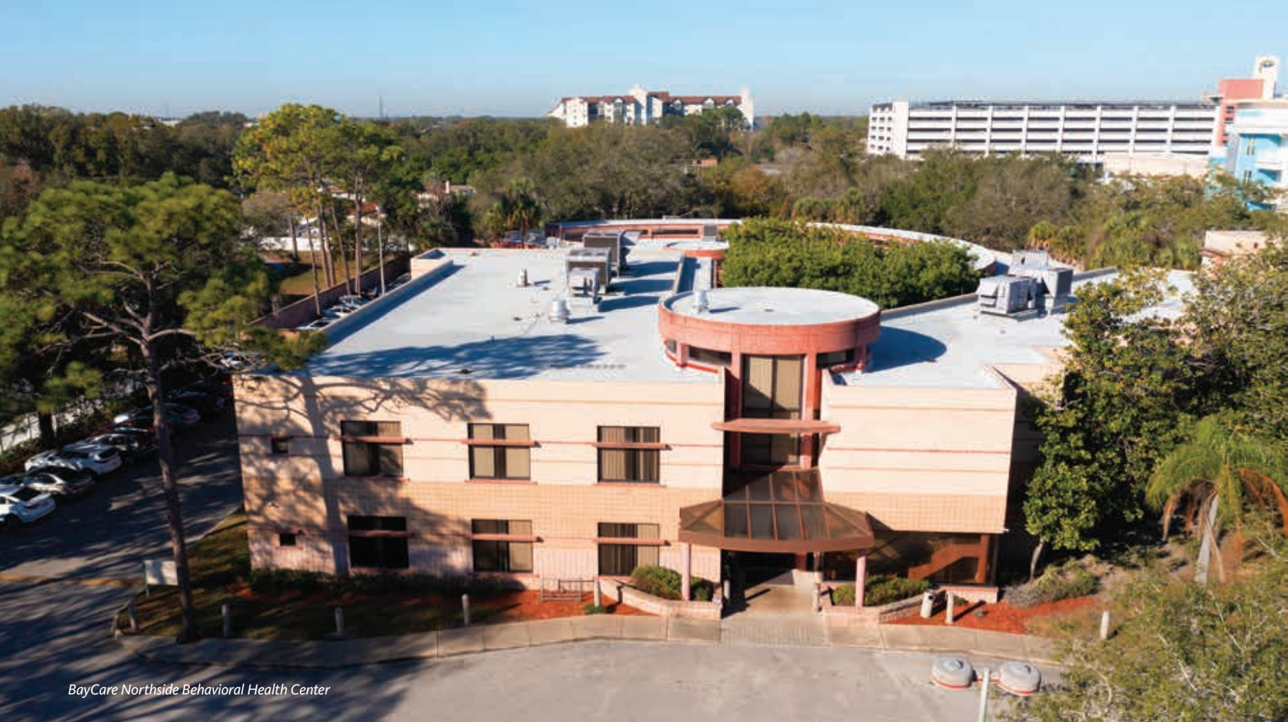
BayCare Northside Behavioral Health Center