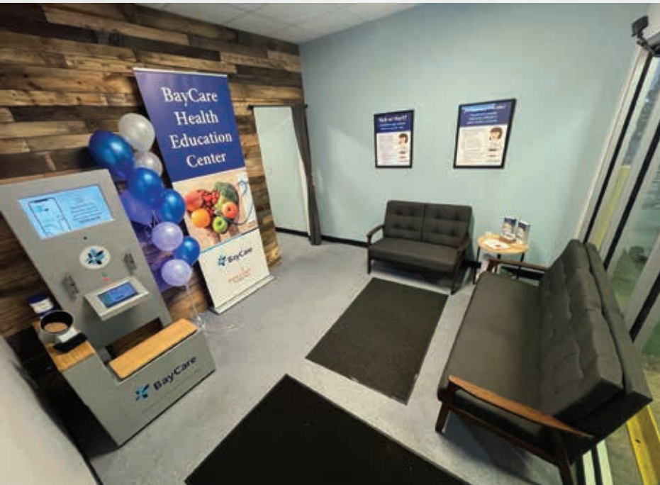
BayCare opened a Health Education Center inside a Feeding Tampa Bay warehouse in Tampa so visitors could receive health information.

For an expanded, web-based version of this report: BayCare.org/AnnualReport