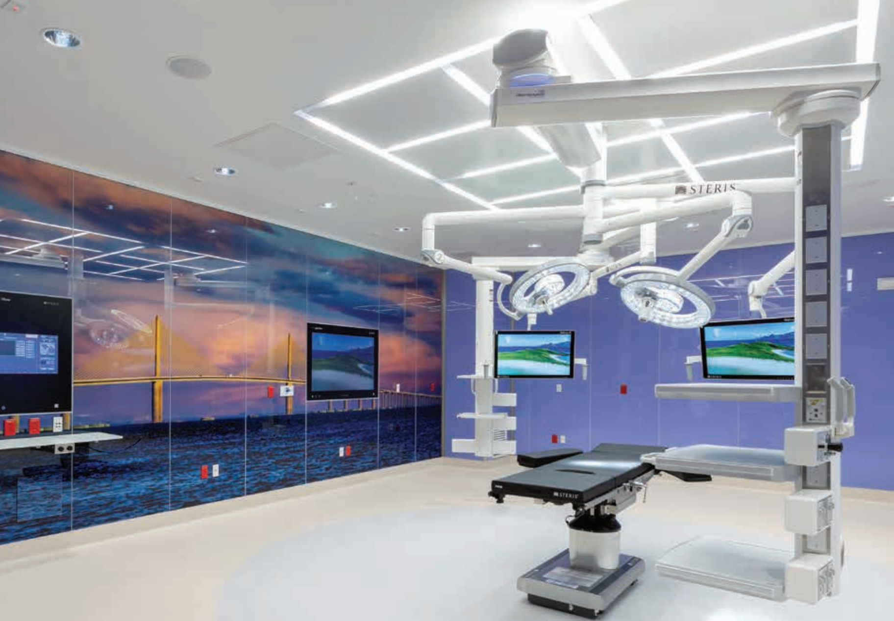
New construction at St. Anthony's Hospital in St. Petersburg included three new operating rooms featuring glass walls with large photographs of local scenes, including this one of Tampa Bay and the Sunshine Skyway Bridge.