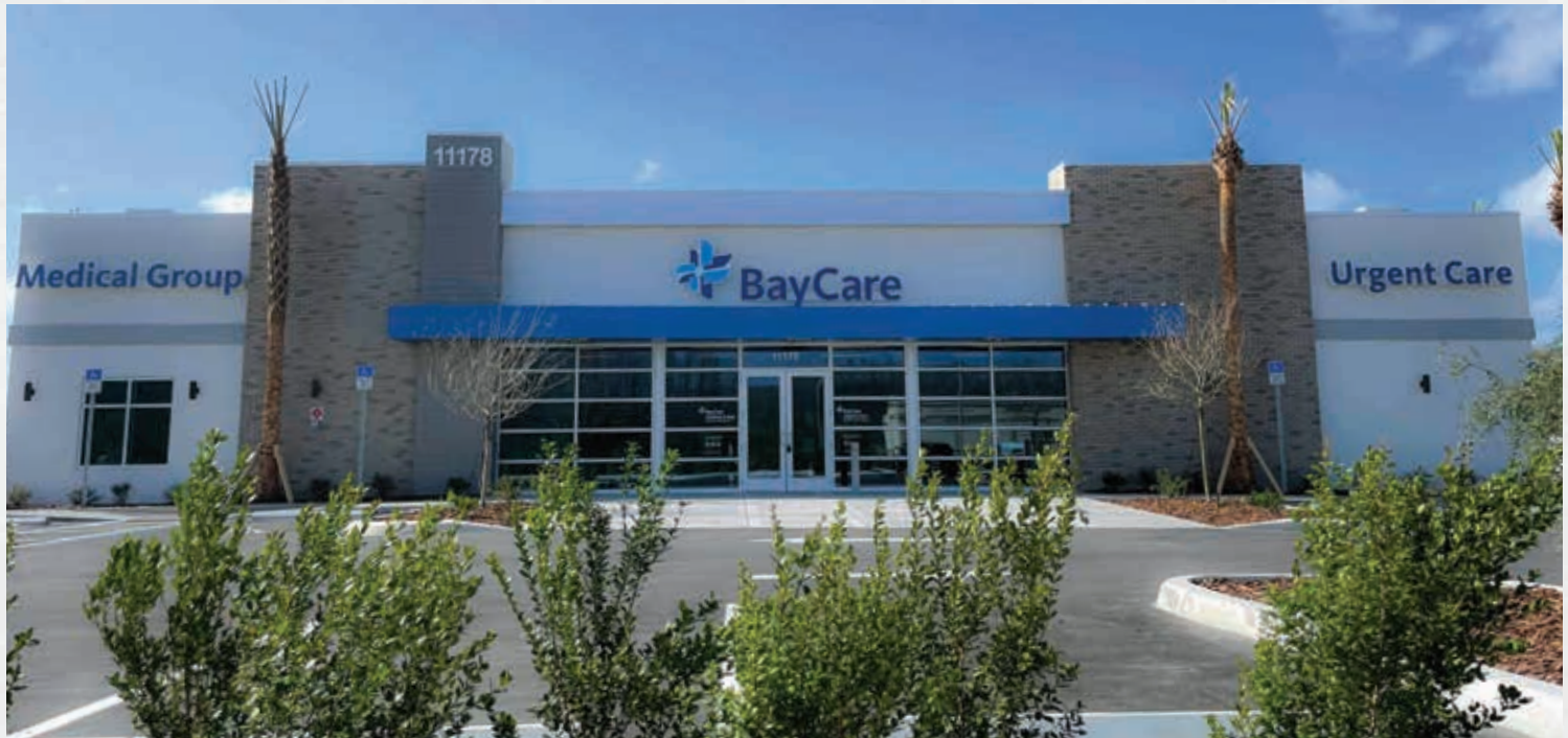
BayCare Trinity East combines multiple health care services in one location in New Port Richey.