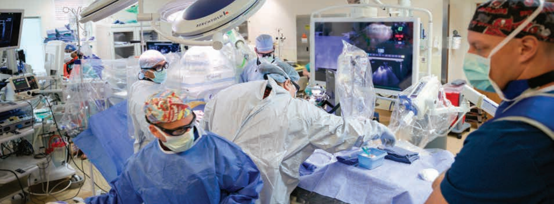
A team at St. Joseph's Hospital prepares to begin a heart procedure.

During 2022, the teams designed or implemented care pathways for sepsis, chronic obstructive pulmonary disease (COPD) and stroke, and for patients presenting at BayCare emergency departments with low-risk chest pain or deep-vein thrombosis. Data is being collected to make sure that the pathways deliver the expected outcomes, and so far, the results prove the pathways' usefulness.