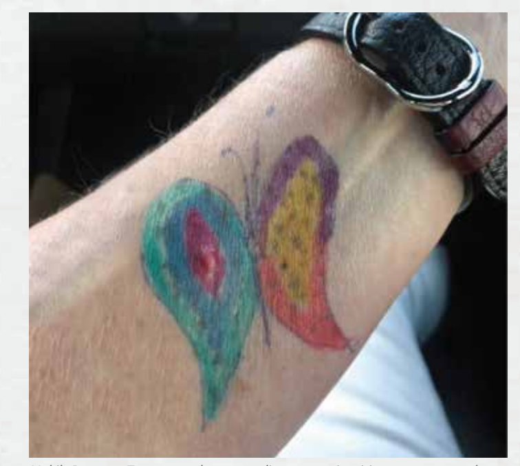
Mobile Response Team counselors responding to teens in crisis may encourage them to draw a butterfly on their wrist with permanent markers, give it a meaningful name, and protect it from fading or harm.

For more information about services offered through BayCare Behavioral Health, go to BayCare.org/Services/Behavioral-Health.