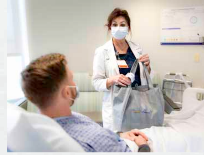
BayCare patients who say they have little to eat at home are given a "Healing Bag" of healthy food before they're discharged.

BayCare has altered its patient record system so that case managers are prompted to ask every vulnerable, high-risk patient with significant social needs about food insecurity and record the answer. Patients are asked questions such as, "In the past 12 months did you worry that you