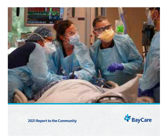
2021 Report to the Community

NONPROFIT ORG. US POSTAGE PAID TAMPA, FL PERMIT NO. 1311