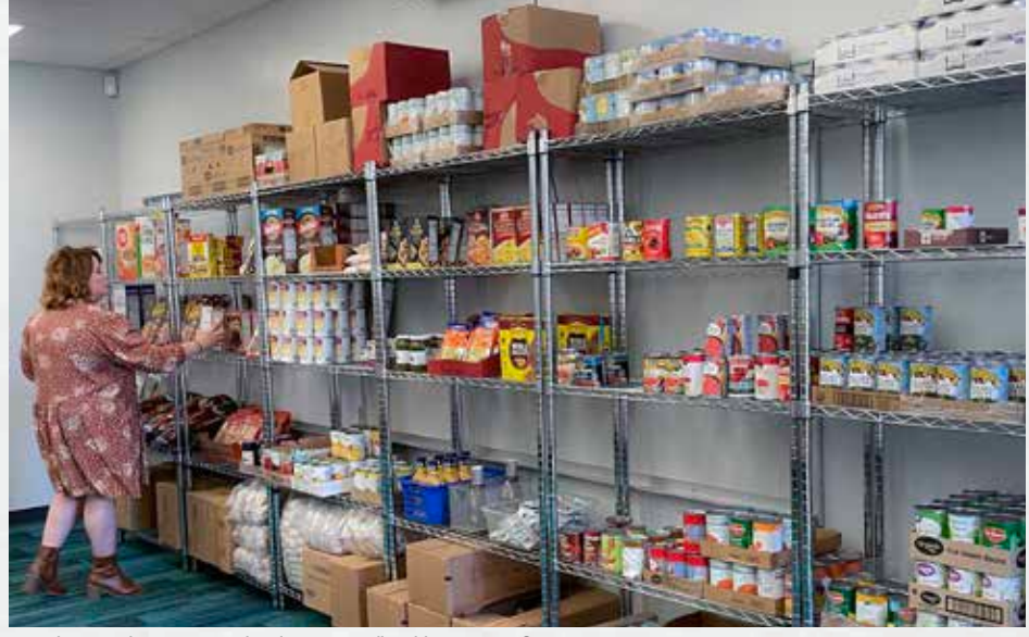
Eisenhower Elementary School secretary/bookkeeper Jenifer Jernigan arranges shelves in the school's Feeding Minds food pantry.

BayCare knows that food is essential to overall health and wellness and to students' long-term mental, physical and academic success. BayCare and Feeding Tampa Bay strive to provide a variety of foods that are healthy and nutritious. The school pantries are stocked with fresh produce, frozen meats and a wide assortment of dry goods such as flour, rice, beans, pastas, whole grain breads and more.