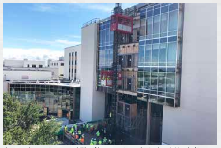
Construction continues on a $152 million expansion at St. Anthony's Hospital in St. Petersburg.