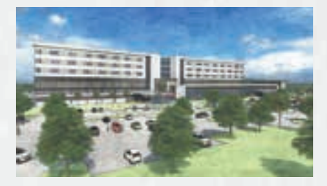
BayCare announces plans to build a new South Florida Baptist Hospital in Plant City to replace the current hospital—a $326 million project.