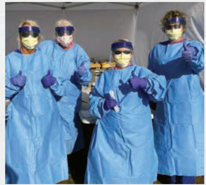
BayCare was the first health system in the region to stand up drive-through COVID-19 testing sites, finding it a safe and convenient method for team members and the public.

In 2020, BayCare was named a People Companies That Care® by Great Place to Work and People magazine for supporting team members and the community during the pandemic. BayCare also was named to FORTUNE'S 100 Best Companies to Work For® 2020, Best Workplaces in Health Care and Biopharma<sup>™</sup> 2020, Best Workplaces for Millennials<sup>™</sup> 2020, Best Workplaces for Women<sup>™</sup> 2020, and Great Place to Work's Best Workplaces for Parents<sup>™</sup> 2020. BayCare also was recognized in 2020 for the sixth year in a row on the Top Workplaces list by the Tampa Bay Times newspaper. That recognition is based entirely on employee surveys.