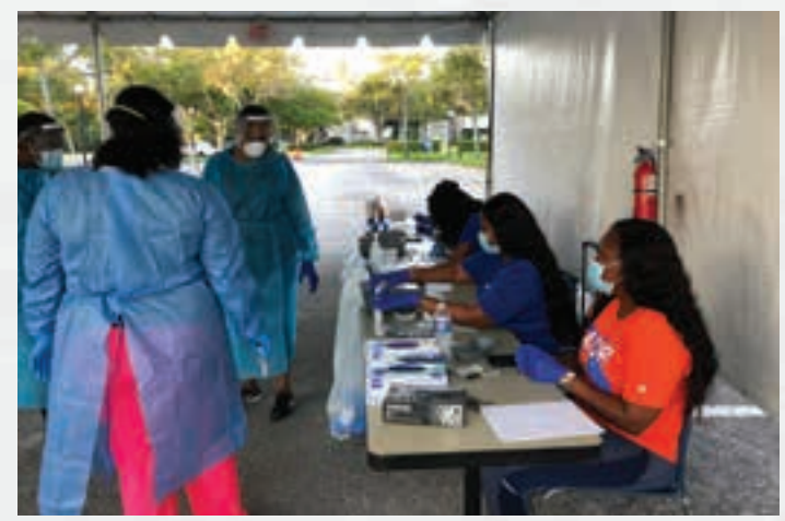
BayCare team members manned drive-through COVID-19 testing sites throughout Tampa Bay.

Many BayCare team members were shifted to different roles or into new work environments to meet the challenges the pandemic created for the health system. They staffed coronavirus testing sites. They performed temperature checks at hospital entrances. They scrambled to convert nonclinical spaces into areas where patients could be served. They fielded thousands of calls in our call centers, responding with reliable information and comforting words to