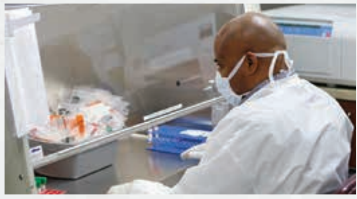
A BayCare Laboratories team member prepares to process swabs from a testing site.

BayCare rewards its team members' hard work, initiative and innovation with competitive salaries and benefits, tuition assistance for certificate and college study, and mentoring and leadership programs for those who want more responsibility. An Employee Assistance Program offers support and financial assistance for team members or their dependents who need help, and an innovative wellness program provides effective ways for team members to make or maintain healthy changes in their lives.