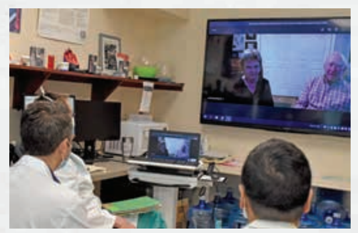
The Structural Heart Team at BayCare's Morton Plant Hospital used technology to conduct a virtual follow-up visit with a cardiac patient and his wife.

They needed to see their patients and this was the most efficient way to do it." The pandemic led the way for government and insurance companies to recognize and pay for telehealth for patients.